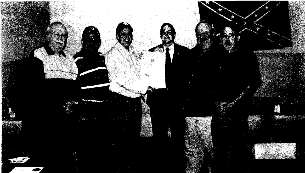
Camp Richard Gano Camp #892 Poteau